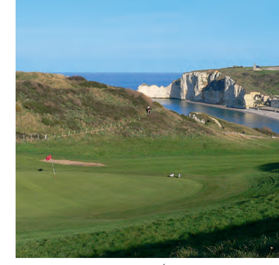
The 18-hole golf course Golf d'Étretat

This cruise departure is also offered as cruise-only option: Golf package (€ 1.700 per person) is optionally added to the regular cruise itinerary.