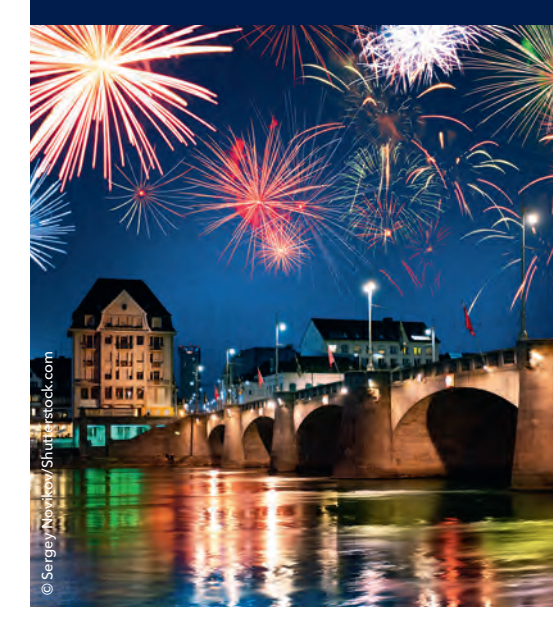
Basel's fantastic fireworks

After a multicourse Gala Dinner, we invite you on the Sun Deck to view the fireworks show.