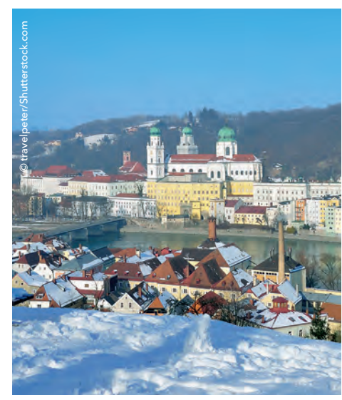
Passau in winter time