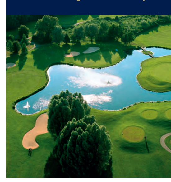
St. Leon-Rot Golf Club

This cruise departure is also offered as cruise-only option: Golf package (€ 1.350 per person) is optionally added to the regular cruise itinerary.