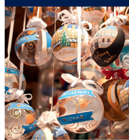
Christmas tree bauble in Vienna