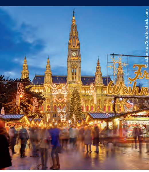
Vienna's Christmas market

Embrace the Christmas season in the fairytale setting of the Danube's legendary winter wonderland. Visit enchanting Christmas markets at Vienna's Schönbrunn Palace and Regensburg's Palais Thurn und Taxis. Sip mulled wine in the heart of the Wachau Valley's wine-growing region. Discover the allure of festive villages dotting the riverscape, and celebrate the day's end with a warm cup of glühwein.