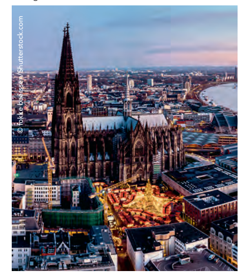
Cologne's Christmas Market