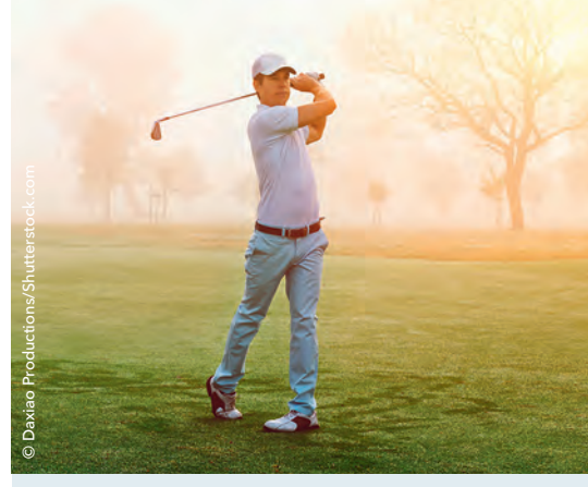
Enjoy a unique golf experience