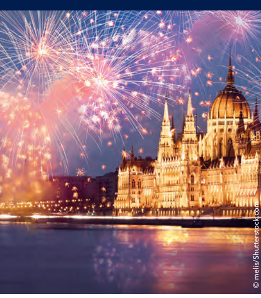
Cheers to the New Year!

Bid farewell to the old and welcome in the New Year in Budapest on board an AMADEUS river cruise ship. Enjoy the festivities with a 5-course Gala Dinner followed by a New Year's Eve celebration with traditional Danube waltzes and a spectacular firework's show. Dance the night away and greet new beginnings amidst the stunning panorama of Budapest's well-lit Parliament.