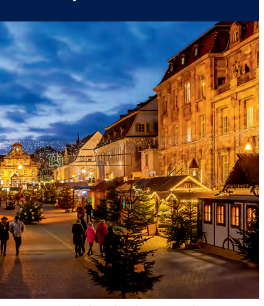
Romantic light at the Christmas market

Commencing in Strasbourg, our Advent cruise takes you through the romantic Middle Rhine Valley to the impressive Rhine metropolis of Cologne. During the winter season, the city sparkles with delight and wonder. Relax on board the AMADEUS Riva and enjoy this joyful time of the year.