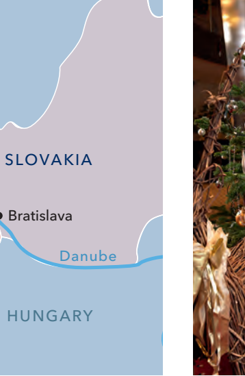
Christmas on board