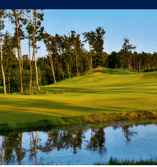
Penati Golf Club

This cruise departure is also offered as cruise-only option: Golf package (€ 1.350 per person) is optionally added to the regular cruise itinerary.