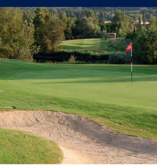
Golf de la Valdaine

This cruise departure is also offered as cruise-only option: Golf package (€ 1.550 per person) is optionally added to the regular cruise itinerary.