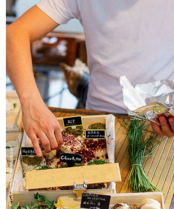
Discover delicacies at the markets