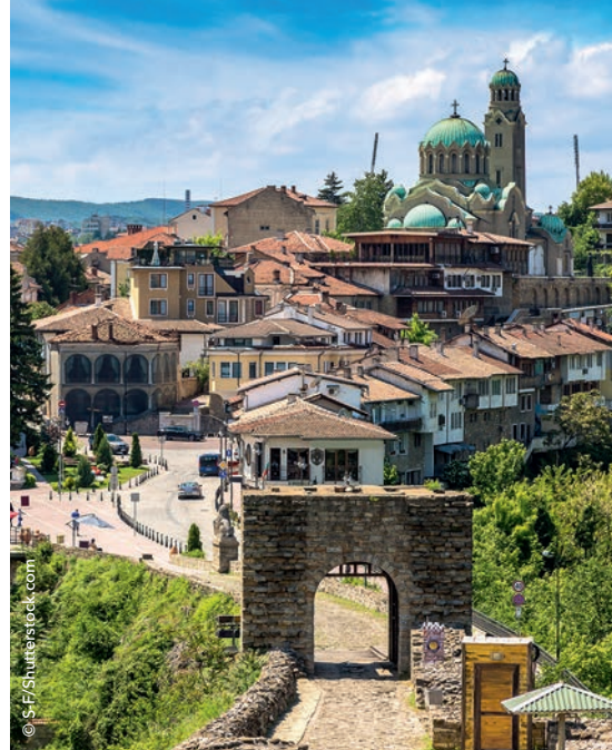
The charming town of Veliko Tarnovo