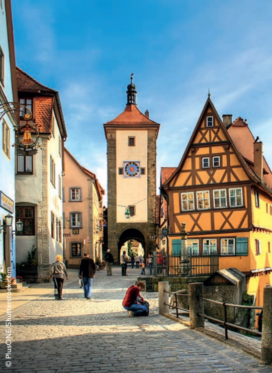
Rothenburg ob der Tauber