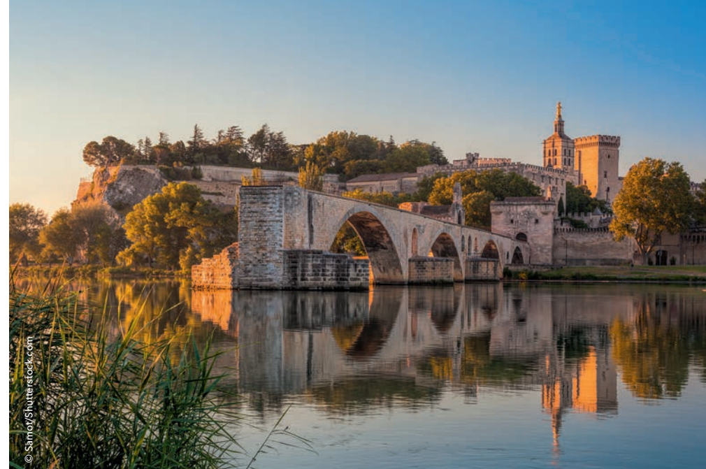
The famous bridge "Pont Saint-Bénézet" and the Papal Palace in Avignon

Please visit www.lueftner-cruises.com for further information on the diverse menu of unforgettable shore excursions. We reserve the right to make amendments to the timetable and program.