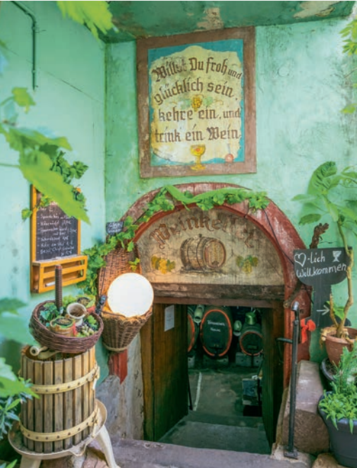
Rüdesheim: wine cellar

“Why is it so beautiful on the Rhine?” Our cruises between Amsterdam and Basel provide a contemporary and thoroughly convincing answer to this question. But you can experience with us not only scenic highlights on the Rhine itself, such as the Upper Middle Rhine Valley with its many castles, but you can also cruise on the Dutch IJsselmeer and make a detour to the winding Moselle.