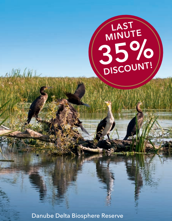
Danube Delta Biosphere Reserve

Journey along paths forged by conquerors, crusaders and kings through Romania, Bulgaria, Serbia, Croatia, Hungary, Austria, and Germany. Enjoy countless architectural jewels and world-famous cities such as Vienna, Budapest and Bucharest. Step back in time to explore the history and mystery living in the hillsides while cruising the Danube and through the Iron Gates.