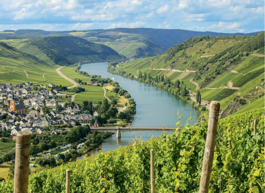
Cochem on the Moselle is romantically embedded in the middle of vineyards