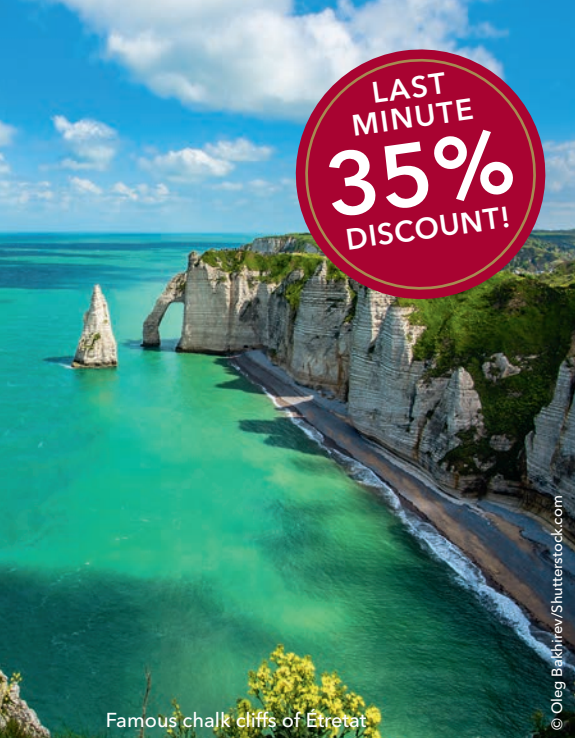
Famous chalk cliffs of Étretat

This week-long cruise aboard the AMADEUS Diamond, begins and ends in Paris – the city of light. Combine the most romantic city in the world with a fascinating journey into the past of the Impressionist masters. Follow the footsteps of Van Gogh, Cezanne and Gauguin while winding along the Seine River into the beautiful Normandy region to Le Havre on the rugged Atlantic Coast.