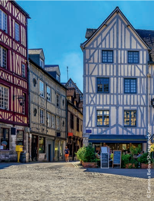
Rouen: medieval alley

This week-long cruise aboard the AMADEUS Diamond, begins and ends in Paris – the city of light. Combine the most romantic city in the world with a fascinating journey into the past of the Impressionist masters. Follow the footsteps of Van Gogh, Cezanne and Gauguin while winding along the Seine River into the beautiful Normandy region to Le Havre on the rugged Atlantic Coast.