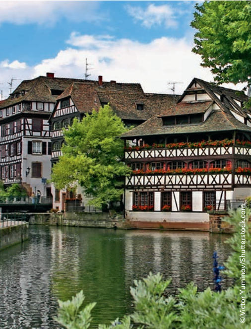
Strasbourg: Petite France

Discover the many beautiful facets of “Father Rhine” along 500 miles of rivers from Amsterdam in the Netherlands through Germany & France to Basel in Switzerland. Pass through the Dutch IJsselmeer on the way to the cathedral city of Cologne. Take a detour along the winding Moselle River and its blossoming vineyards tucked on each side of the valley. Delight in the panorama of the myth-enshrouded Middle Rhine Valley with its high concentration of castles nestled on sunny hillsides around every bend.