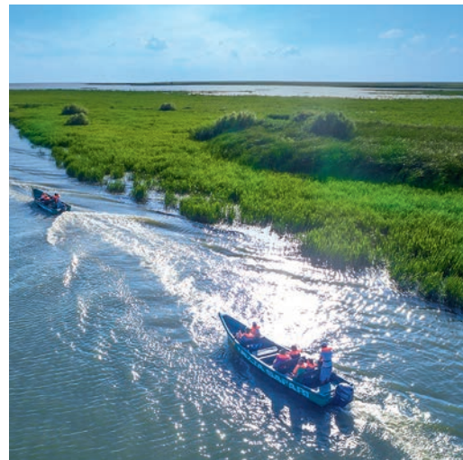
Experience the Danube Delta

Journey along paths forged by conquerors, crusaders and kings through Romania, Bulgaria, Serbia, Croatia, Hungary, Austria, and Germany. Enjoy countless architectural jewels and world-famous cities such as Vienna, Budapest and Bucharest. Step back in time to explore the history and mystery living in the hillsides while cruising the Danube and through the Iron Gates.