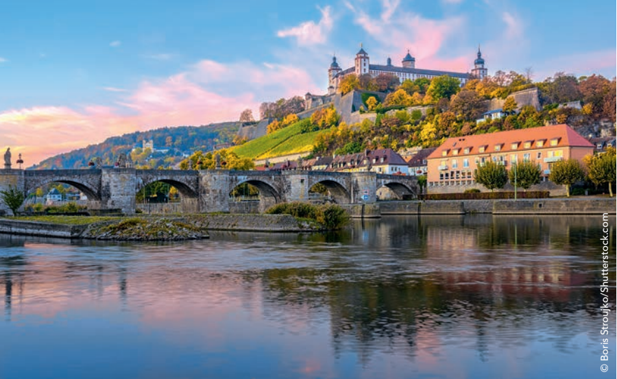
Würzburg: Marienberg Fortress