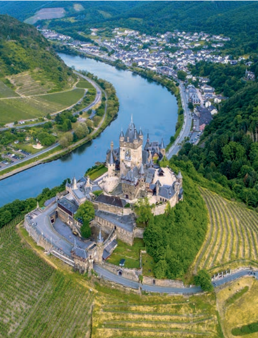
Panoramic view at the Reichsburg and Cochem

MOSELLE · RHINE · MAIN · MAIN-DANUBE CANAL