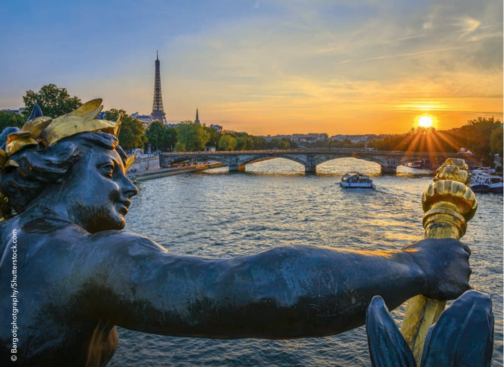
Paris: View from the famous Ponte Alexandre III bridge to the Eiffel Tower

Excursions listed in blue are not included in the cruise price. Please visit www.lueftner-cruises.com for further information on the diverse menu of unforgettable shore excursions. We reserve the right to make amendments to the timetable and program.*Excursions operate at the same time; only one may be booked.