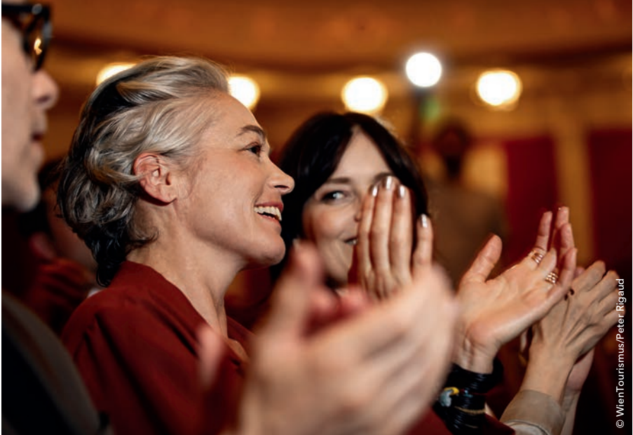
Enjoy the private concert in the Duna Palace in Budapest.

Please visit www.lueftner-cruises.com for further information on the diverse menu of shore excursions and deck plans.