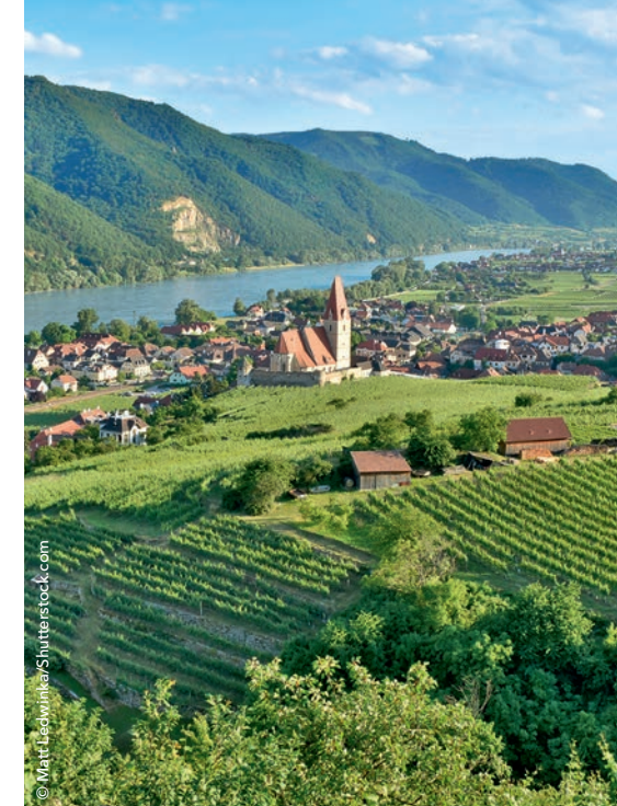
Weissenkirchen in the beautiful Wachau

Prague city tour optionally bookable (€ 60)