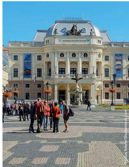
Bratislava: Slovak National Theatre

Travel into the very heart of the continent of Europe, where empires were built, kings and queens were crowned and some of the world's greatest music was composed and performed by the likes of Mozart and Beethoven. Explore the timeless Grand European cities of Vienna, Bratislava and Budapest and visit the nature-protected Danube breakthrough near Weltenburg as well as the world-famous Mozart city Salzburg.