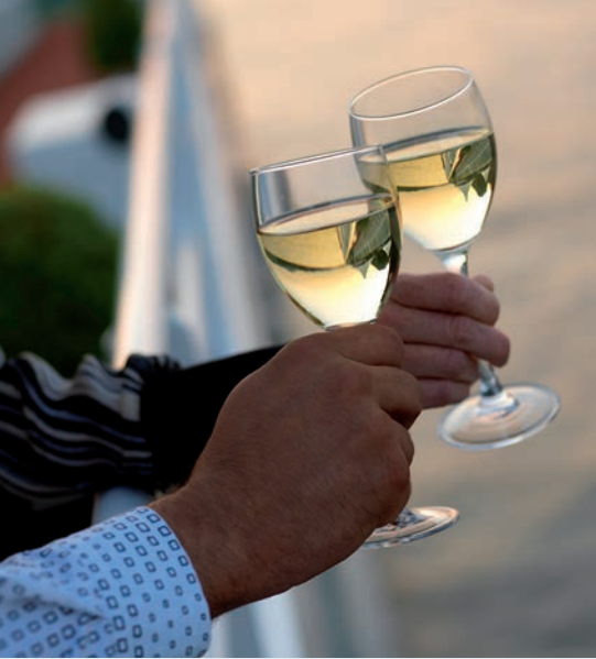
Relaxation on the sun deck