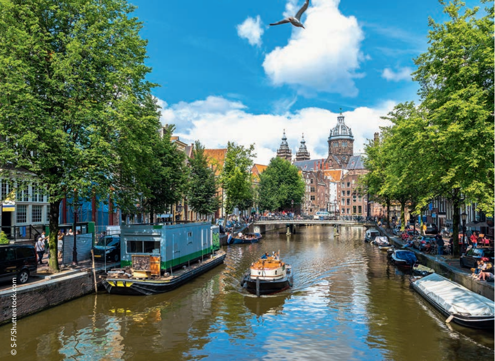
A walk along Amsterdam’s canals is a must for every visitor...