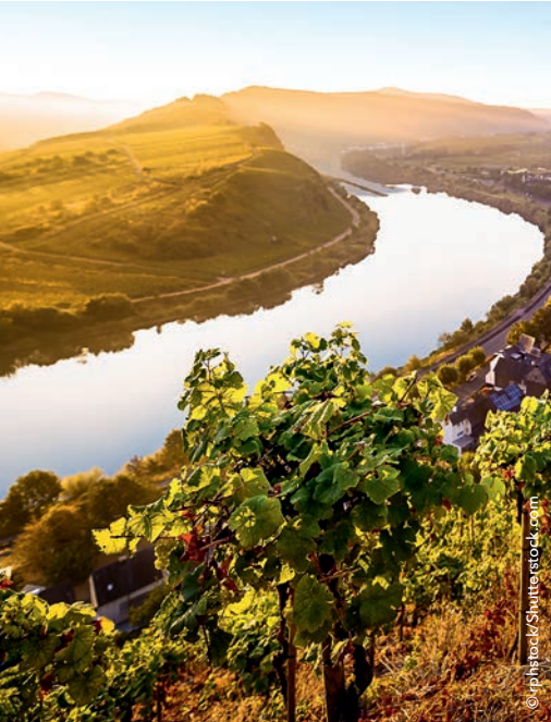
Panoramic views of the Moselle vineyards

Excursions listed in blue are not included in the cruise price. Please visit www.lueftner-cruises.com for further information on the diverse menu of unforgettable shore excursions. We reserve the right to make amendments to the timetable and program.