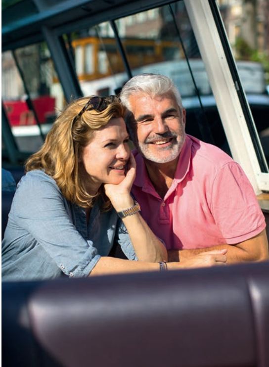
Canal cruise in Amsterdam