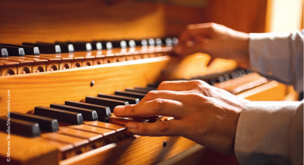
Organ concert in Strasbourg

Excursions listed in blue are not included in the cruise price. Please visit www.lueftner-cruises.com for further information on the diverse menu of unforgettable shore excursions. We reserve the right to make amendments to the timetable and program.