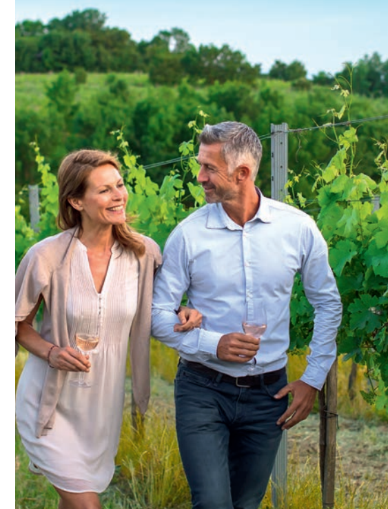
Enjoy a stroll through the vineyards

Prague city tour optionally bookable (€ 60)