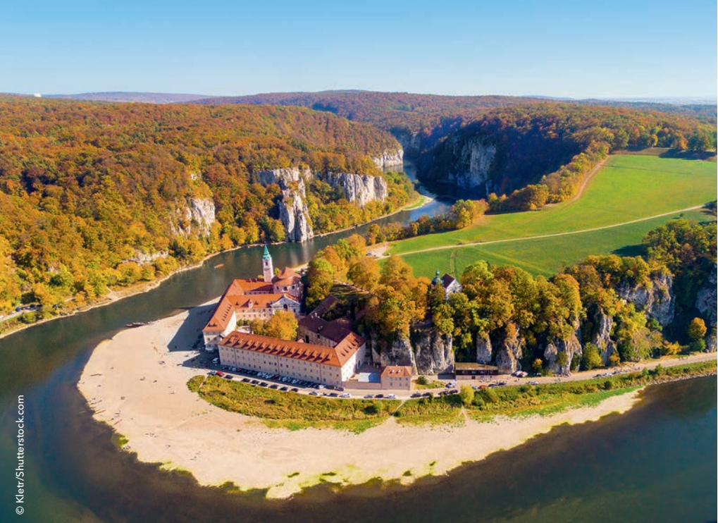
The Benedictine abbey of Weltenburg is the oldest monastery in Bavaria