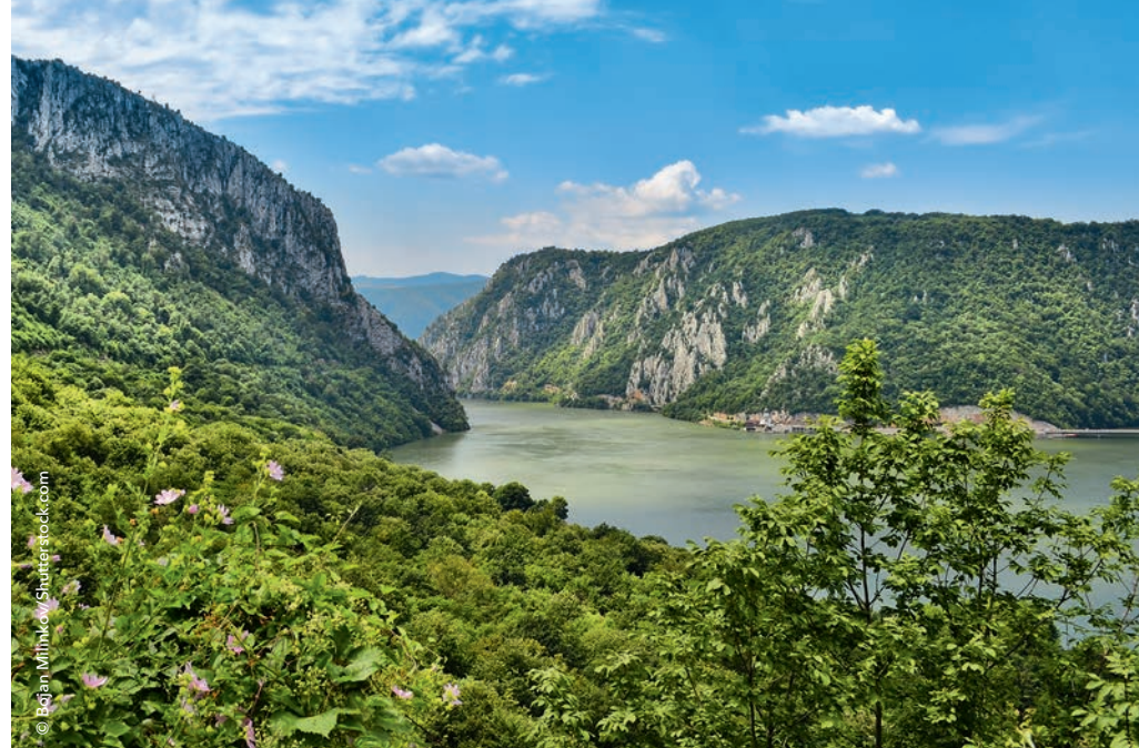
The impressive Iron Gates of the Danube River between Serbia and Romania