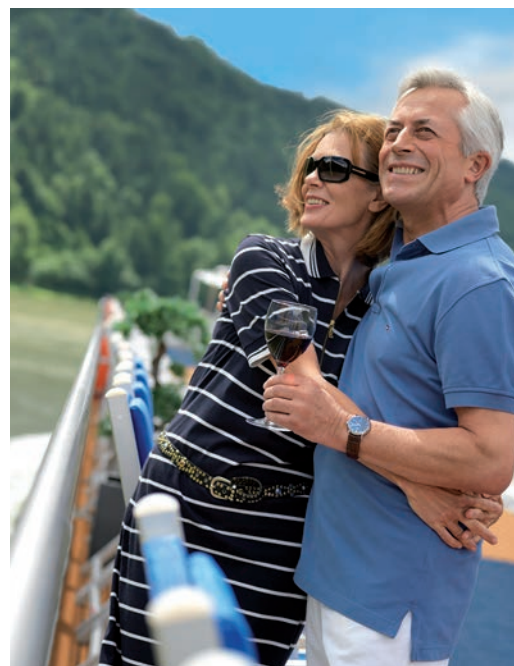
Enjoy a relaxed and safe journey

Travelling on the mighty Danube: This classic cruise along the beautiful Danube connects Passau, the “Three Rivers City” of the Inn, Ilz and Danube with the “Queen of the Danube” – the capital city Budapest. Traverse four of Europe’s most important countries while visiting three world famous capital cities. This scenic cruise through beautiful landscapes, including the UNESCO protected Wachau Valley, is full of culture, history and charm.