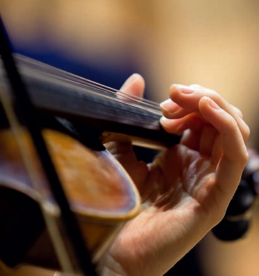
String concerts on board and on land