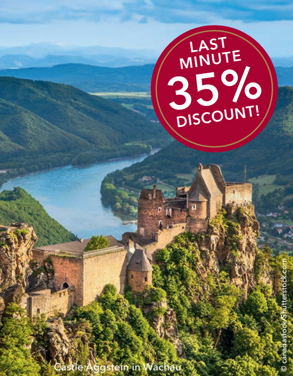
Castle Aggstein in Wachau

Journey to the heart of the once-illustrious Habsburg monarchy, along the fabled Danube River. Explore the art and culture of historic Europe as your vessel travels through four countries filled with spectacular scenery. Visit three world-famous capital cities of Vienna, Budapest and Bratislava. Admire the majestic Melk Abbey, the beauty of the Hungarian countryside and taste the regional wines of the Wachau Valley as you discover the best of Europe.