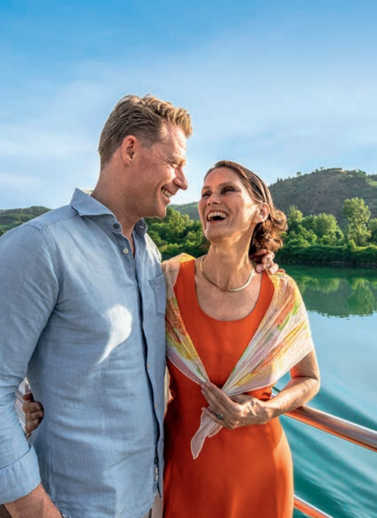
Enjoy the view from the sun deck