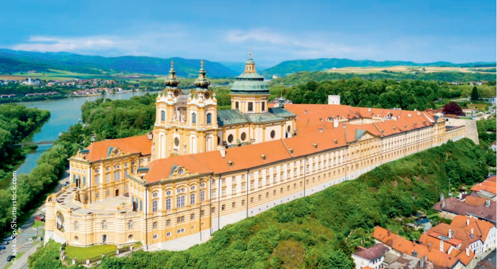
Melk Abbey is one of the most significant Baroque constructions and most-visited sights in Austria.

Excursions listed in blue are not included in the cruise price. Please visit www.lueftner-cruises.com for further information on the diverse menu of unforgettable shore excursions. We reserve the right to make amendments to the timetable and program.