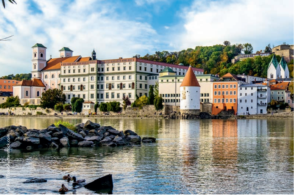
The charming Baroque city Passau