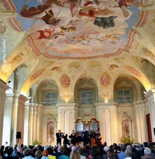
Melk Abbey: the famous hall of St. Koloman