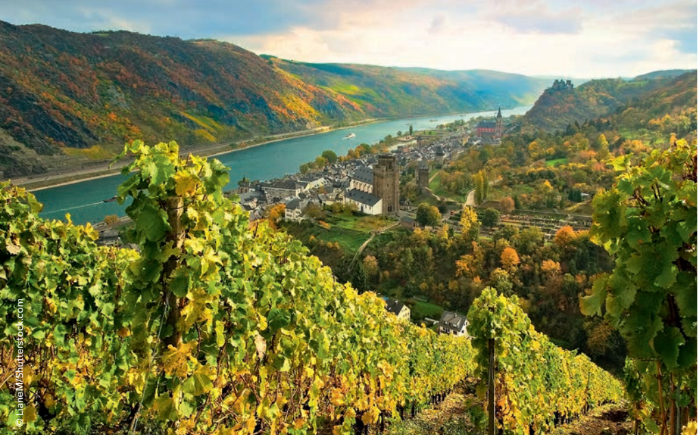
Oberwesel: the city of towers and wine