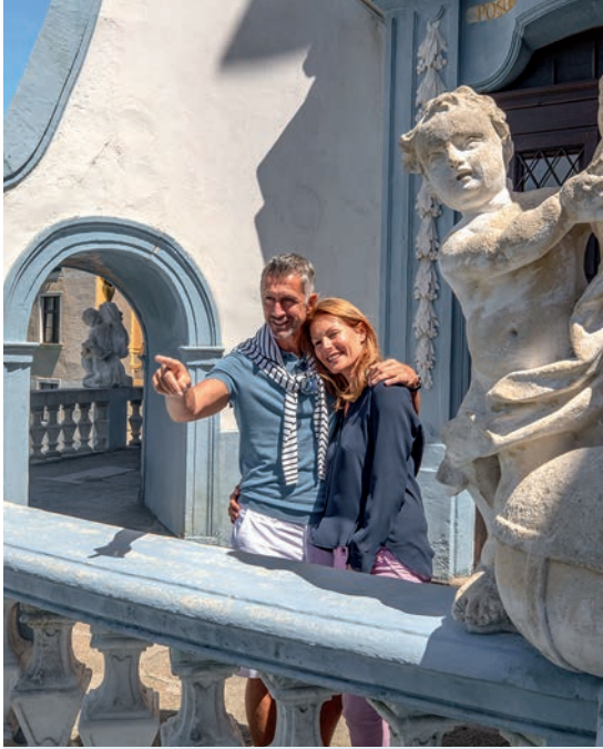
Enjoy the view from Melk Abbey