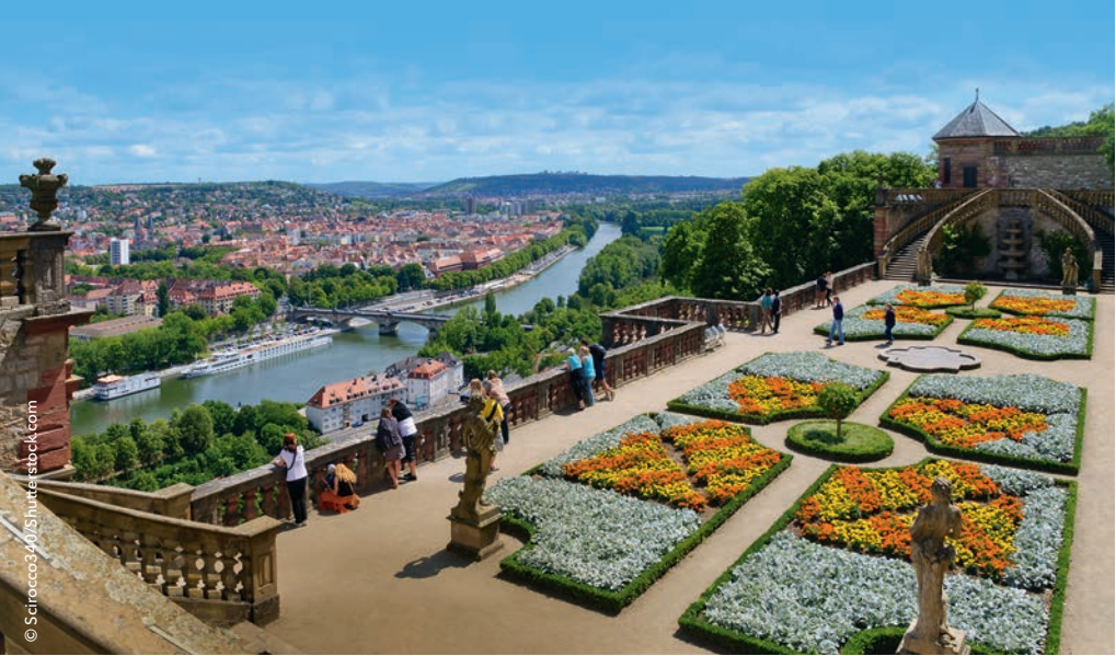
Würzburg: View from the green terraces of Marienberg Fortress