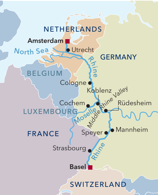
WATERWAYS OF HOLLAND · RHINE

Embark on a voyage of music along the Rhine celebrating the 250th anniversary of Ludwig van Beethoven's birth this year. Enjoy the picturesque Rhine river as we make our way from Amsterdam on the North Sea, through the beautiful scenery of the Middle Rhine Valley and down the river to Basel in Switzerland, accompanied by the dazzling sound of exclusive concerts both onboard and ashore.