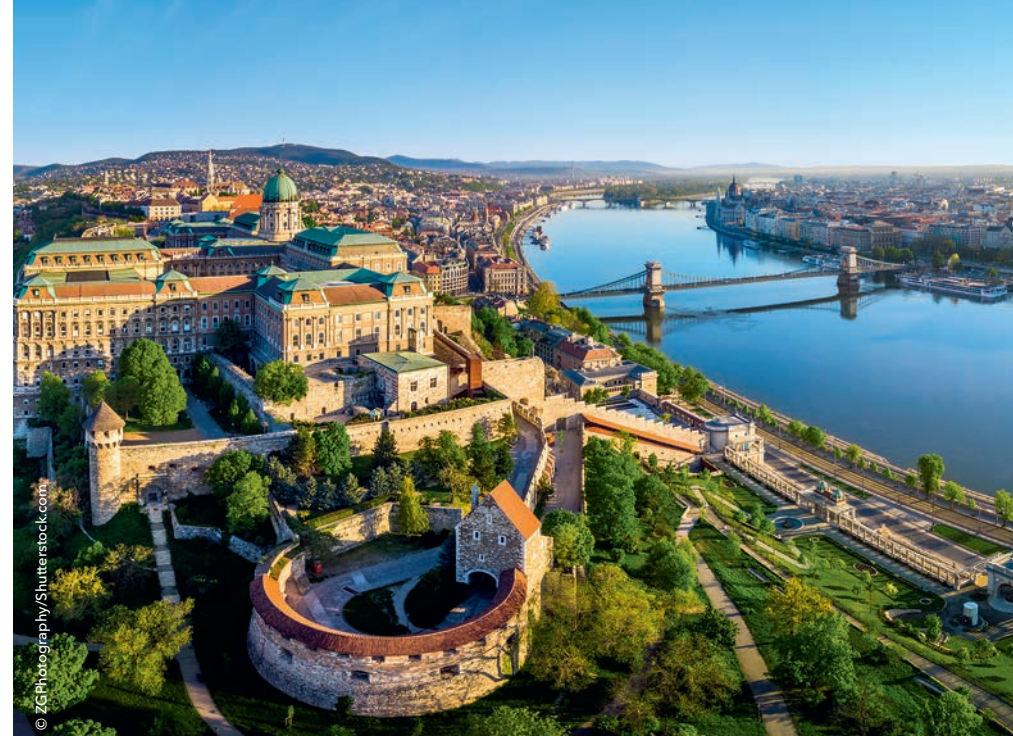
Panoramic view of Budapest with the monumental Buda Castle

Please visit www.lueftner-cruises.com for further information on the diverse menu of unforgettable shore excursions. We reserve the right to make amendments to the timetable and program.*Excursions operate at the same time; only one may be booked.