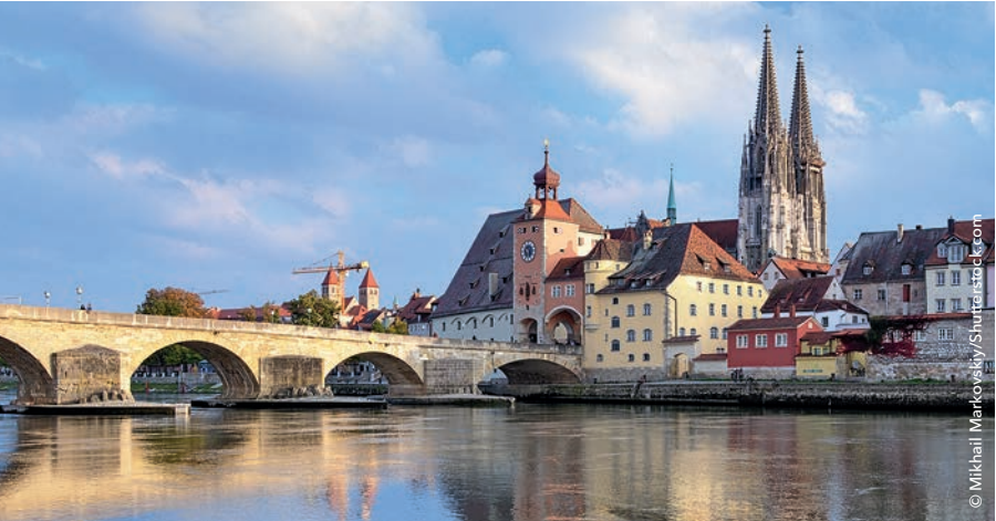
The UNESCO World Heritage City of Regensburg