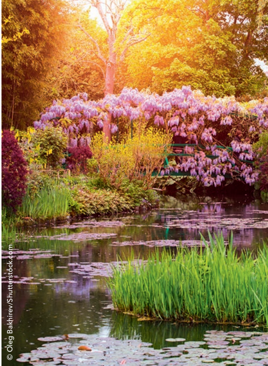
Monet's garden in Giverny

* Excursions operate at the same time; only one may be booked UP = Unit price if booked on board